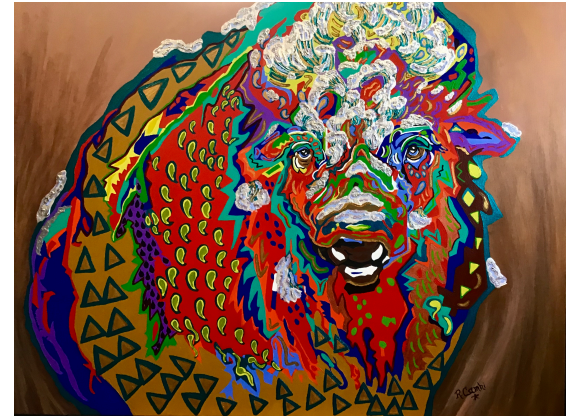
The Bills Fan in Arles

As a retiree, I started taking art classes and art has become a big part of my life. I work in acrylics, pastels, and mixed media. My artwork has been displayed at the Jewish Community Center, the Audubon Senior Center, and at Millard Fillmore Suburban Hospital. I am also a resident artist at River Art Gallery in North Tonawanda.