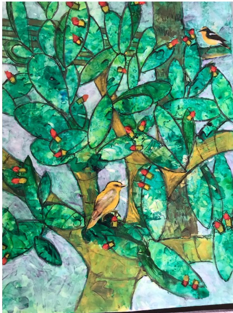
Painting by Elaine LaVigne